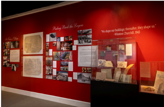
A Coronado Historical Association exhibit looks at the history and restoration of the historic Hotel del Coronado.