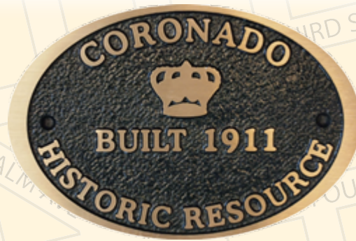
Plaque provided by the City of Coronado to home owners.

Here are the homes that received their Mills Act plaques at the May City Council Meeting on May 1, 2016.