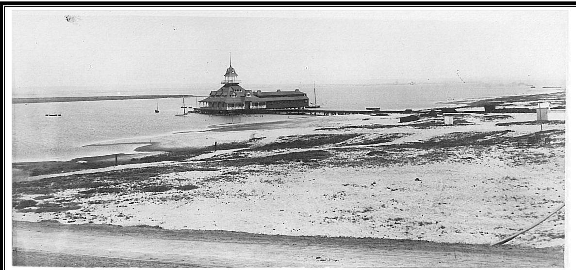
Caption: One of the earliest photos of the Boathouse and Glorietta Bight, 1887.